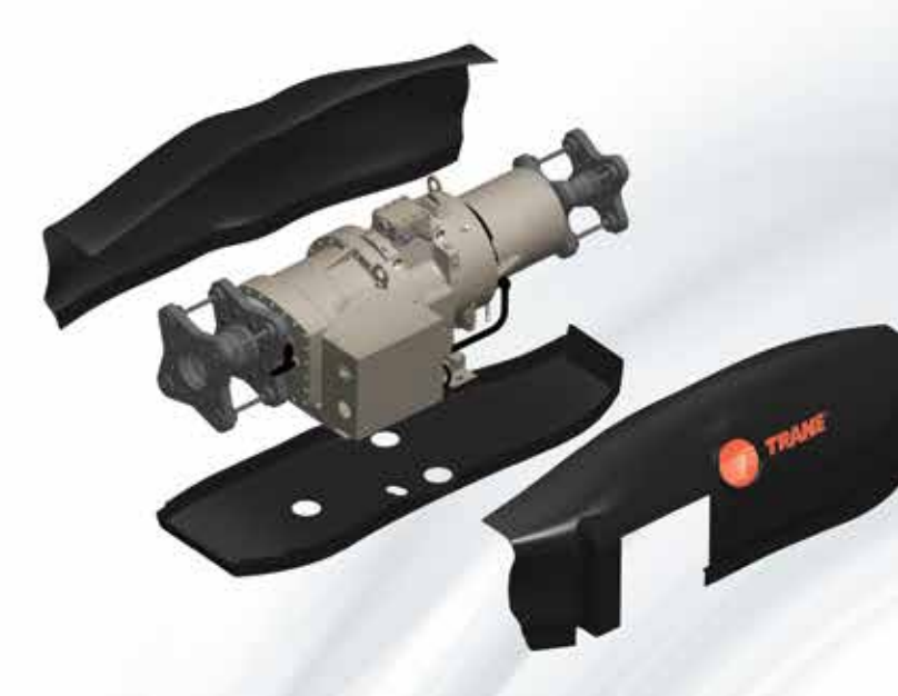
Patented compressor enclosure and metallic bellows absorb vibrations from normal compressor operation.

The InvisiSound Ultimate package also includes a user-selectable noise-reduction mode that can be activated to limit the maximum condenser fan speed, achieving even lower sound levels. This feature allows you to actively manage the unit's operation to comply with nighttime and weekend noise restrictions.