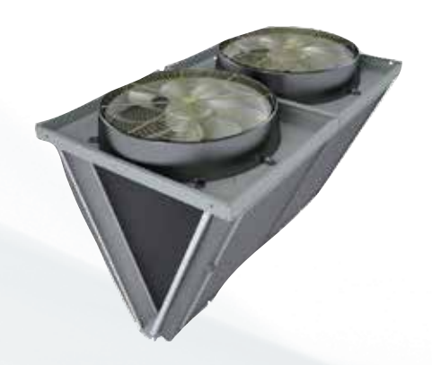
Variable-speed condenser coil fans help reduce sound output.

HVAC system noise levels can vary widely, and excessive noise can impact the performance, productivity and overall satisfaction of building occupants —as well as occupants of neighboring structures. That is why quiet operation is designed into every Trane® Stealth™ air-cooled chiller, and different levels of InvisiSound™ acoustic reduction treatments are available to give you the flexibility to meet specific application needs.