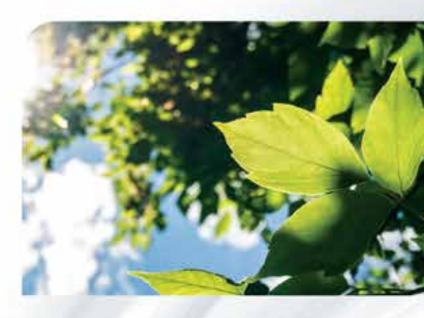
The increased efficiency and reduced refrigerant charge of a Stealth chiller can help earn multiple LEED® points for your building and qualify for energy rebates and incentives offered by many utility companies across the country.